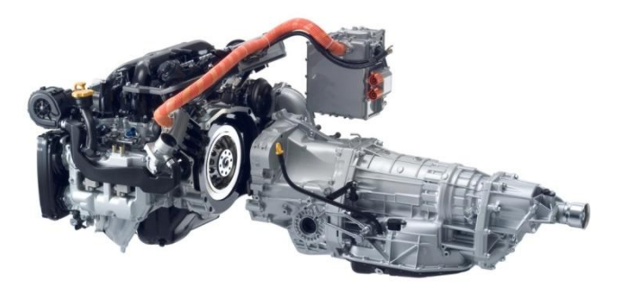
Fig. 2. Parallel Type

Gasoline engine and electric motor work together to move the car forward