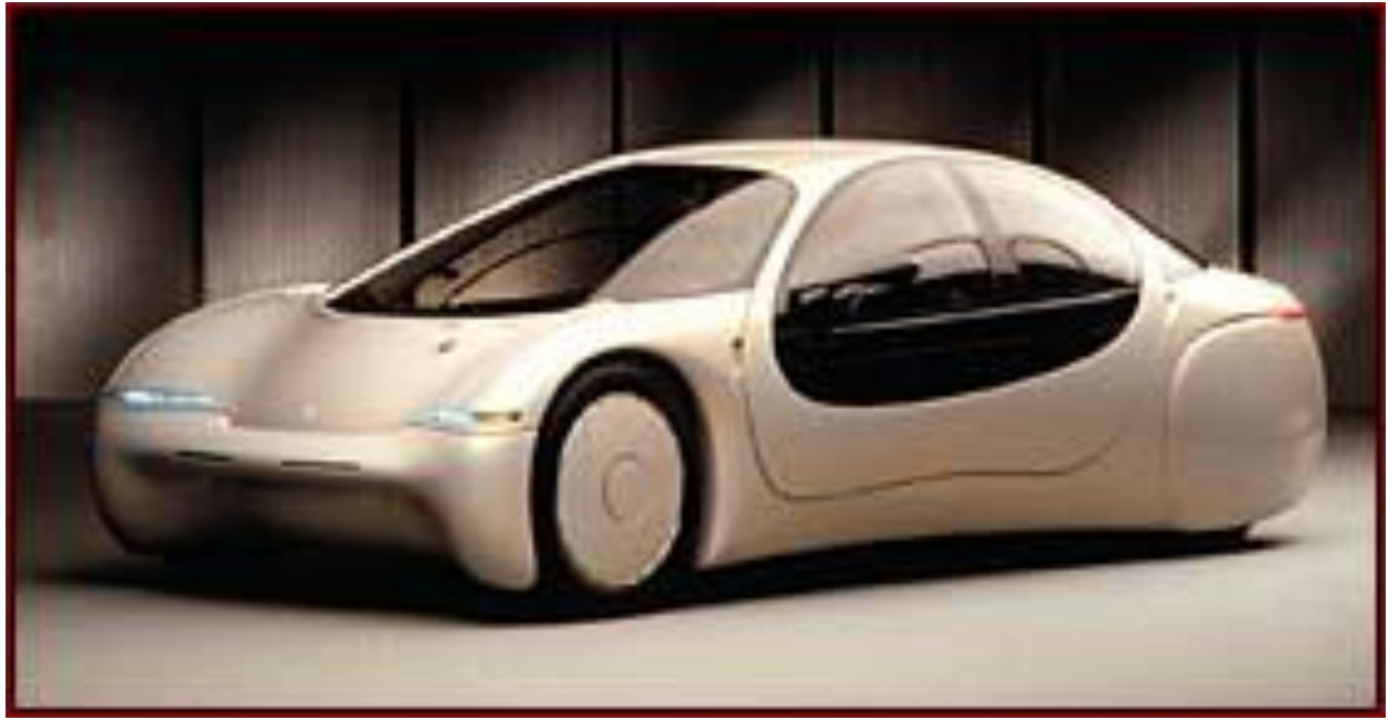
Fig. 1. Hyper Car

The process of adopting new technologies is very slow. The main problem for the installation of new facilities is the starting price. This raises the price of energy obtained in the first few years at the level higher then energy available on conventional methods. A large part of energy production from renewable sources is the result of ecological consciousness of the population, which in spite of initial economic cost install facilities for the production of "clean" energy. The European community has a strategy for doubling the use of renewable energy sources. The plan contains a series of measures to encourage private investment in facilities to convert renewable energy into usable energy (the most part into electricity). In addition, the state of the European Union (EU) have set another ambitious goal to increase the share of renewable energy sources 20% of overall energy consumption in the EU until 2020. year.